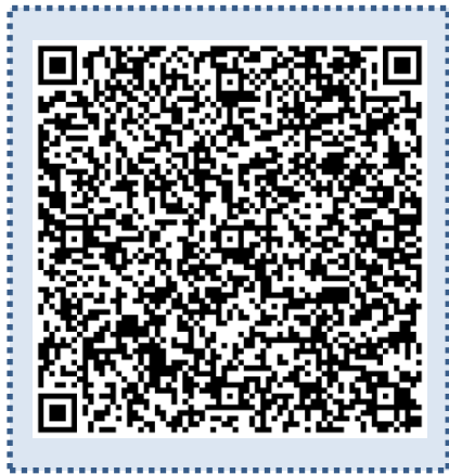
「國立金門大學公共關係組」 FB 粉絲專頁